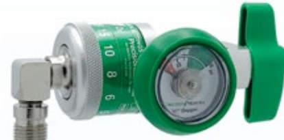
90° DISS Male (DSDR) 168715DSDR shown