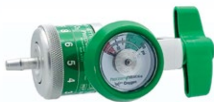
Tubing Nipple 168708D shown