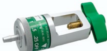
No Gauge (NG) 168708DNG shown