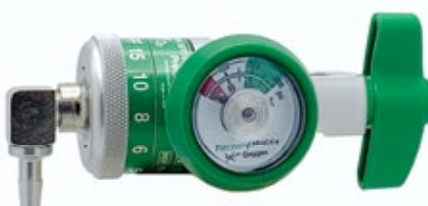
90° Hose Barb (DSR) 168715DSR shown