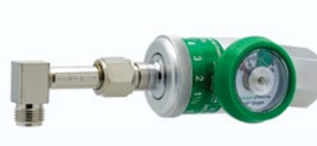
Extended (X) 165404DSDSLX shown