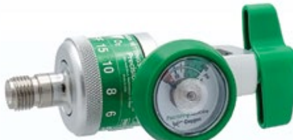
DISS Male (DSDS) 168715DSDS shown